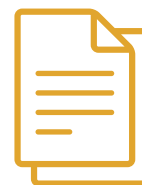
Pulp and Paper