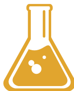
Inorganic Chemical Manufacturing