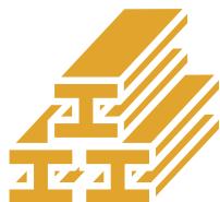
Iron and Steel Manufacturing