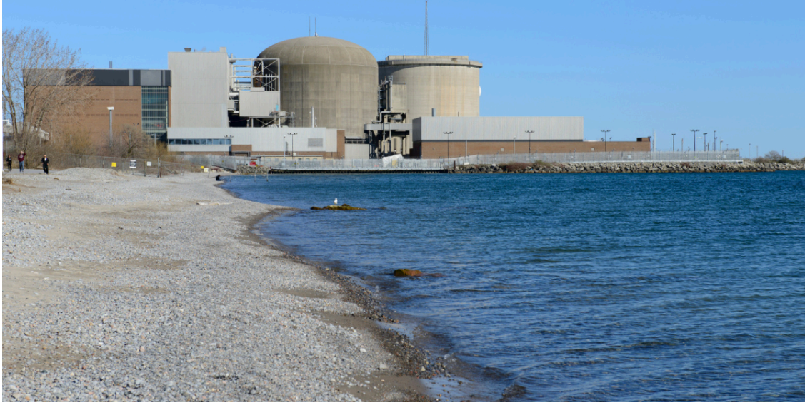
Image of Pickering Nuclear Generating Station