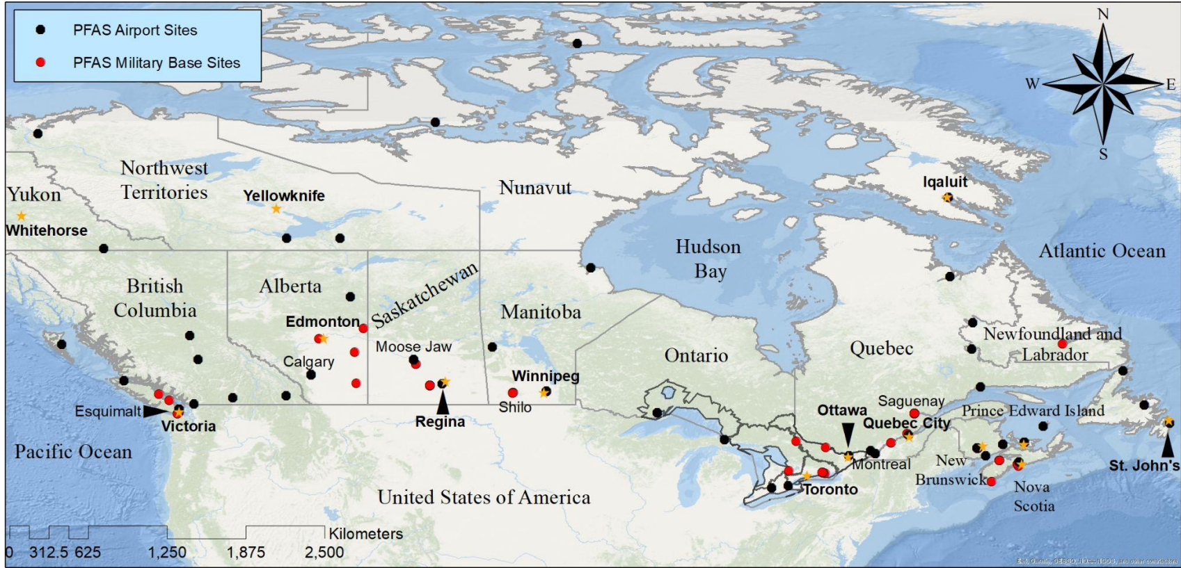
Great Lakes-St. Lawrence River Basin