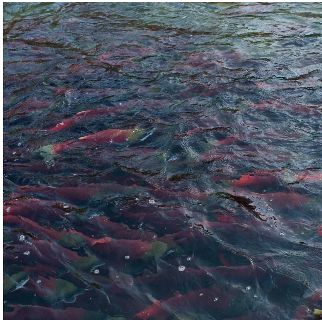
WATERSHED WATCH SALMON SOCIETY

The policy goal in the 1986 Policy for the Management of Fish Habitat (1986 Policy) was to ensure a net gain of habitat for Canadian fisheries resources, a goal that was widely lauded though difficult to achieve in practice. The Fisheries Protection Policy Statement, 2013, which replaced the 1986 Policy when the Fisheries Act was amended, omits this goal. The concept of no net loss should be restored through policy or amendment to the statute or regulations.