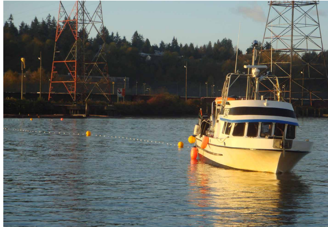
WATERSHED WATCH SALMON SOCIETY

We recommend additional purposes or preambles to assist with interpretation of the Fisheries Act . For example, the US Magnuson Stevens Fishery Conservation and Management Act has seven purposes, including to take immediate action to conserve and manage the fishery resources found off the coasts of the United States, and to promote the protection of essential fish habitat in the review of projects conducted under federal authority. 19 Other federal environmental laws contain useful precedents of purposes or preamble clauses, such as the Oceans Act , Migratory Birds Act and Canadian Environmental Assessment Act, 2012 .