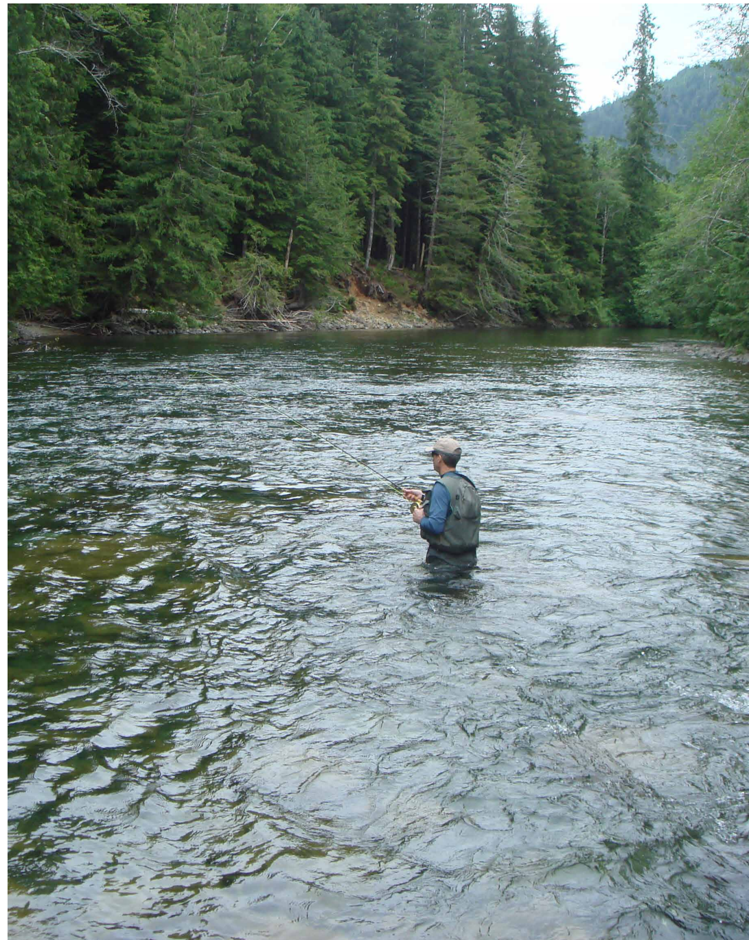
WATERSHED WATCH SALMON SOCIETY

DFO's current policies such as the Wild Salmon Policy and the Policy to Manage the Impacts of Fishing on Sensitive Benthic Areas can provide guidance for this designation. These policies do not have the force of law. Including a requirement to identify and describe EFH (particular areas that would not be eligible for offsets or habitat compensation) to the extent possible would augment the general duty to protect all fish habitat. The Act should include a requirement for processes for Indigenous groups, fishing organizations and coastal community residents to identify such areas for enhanced protection.