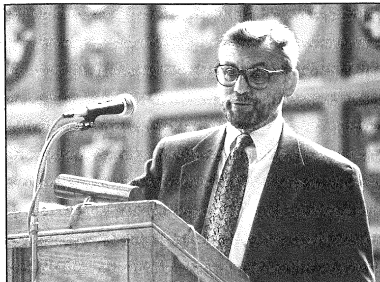
Minister Wildman addresses the Wednesday Afternoon Plenary

Wednesday's luncheon address was delivered by the Honourable Bud Wildman, Minister of Environment and Energy. The Minister emphasized the importance of the Statements of Environmental Values: "The Ministry of Environment and Energy has developed its draft Statement of Environmental Values -- or SEVs -- and is assisting the thirteen other prescribed ministries as they develop theirs. The statements will set the standard against which MOEE and the government's performance will be measured -- by the public and by the Environmental Commissioner." The Minister used the luncheon as an opportunity to announce a regulation that sets a strict timetable for the phase-out of ozone depleting refrigerants (see page Phase-Out of Ozone Depleting Substances on page 4 ). Summary of Final Plenary on Page 3.