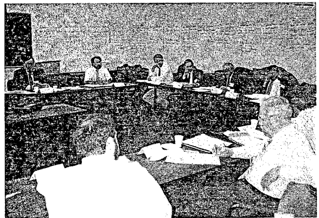
A meeting of the Western New York Roundtable, which established regulatory ground rules agreeable to all wetlands stakeholders