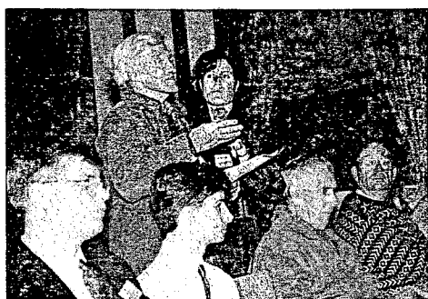
A citizen testifies at an IJC water levels hearing in Chicago

The results of the study indicated that very few shoreline property owners actually suffered damage to their residences as